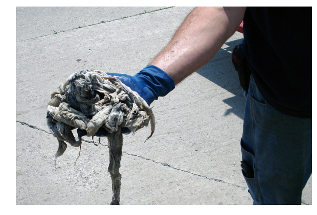
Nonwoven wipes clog sewers and equipment in pump stations and wastewater treatment plants because they don't break apart in water. The extra maintenance required to remove them comes at a cost to all sewer system users.